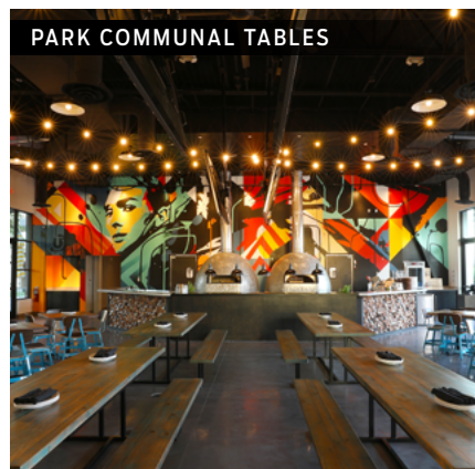
PARK COMMUNAL TABLES