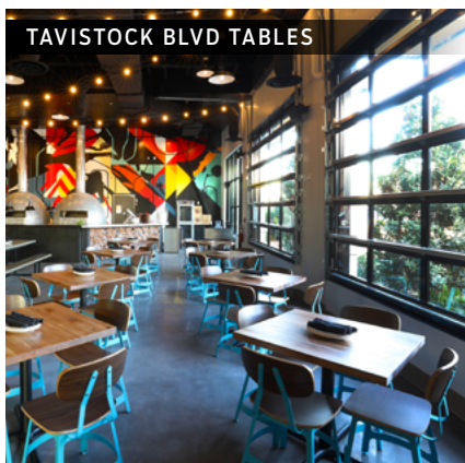
TAVISTOCK BLVD TABLES